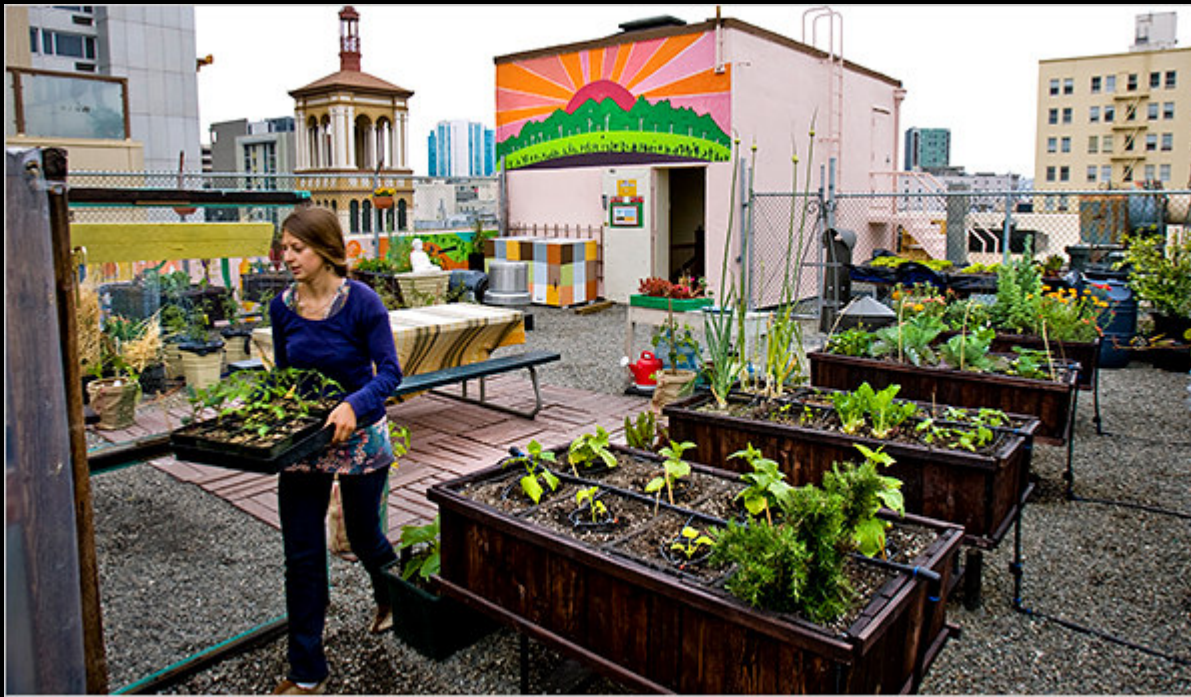
Rooftop garden of Glide Memorial Church in San Francisco

the growing , processing, and distribution of food and other products through intensive plant cultivation and animal husbandry in and around cities