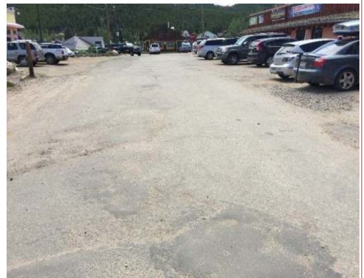
Roadway conditions have deteriorated and a sidewalk doesn't exist to access municipal facilities.