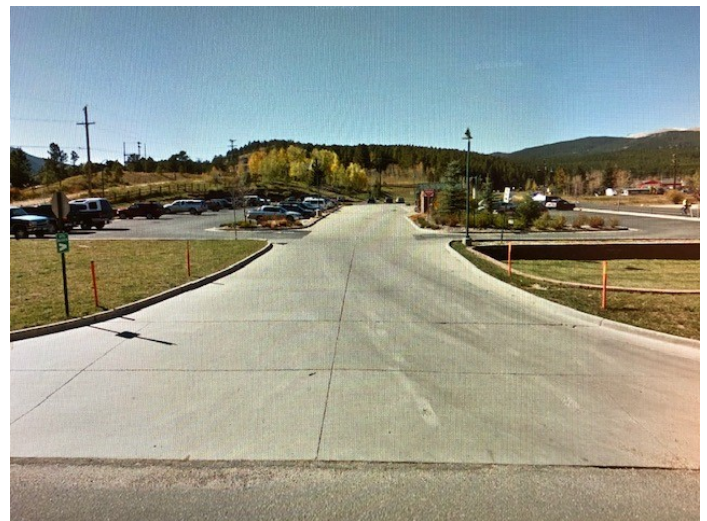
There is no sidewalk that connects the RTD Park-n-Ride to the rest of downtown. Walkers, bikes, and people with disabilities have to travel in the road way to access this facility.

Nederland's proposed project aligns with the MVRPT by providing roadway, transit improvements, and bicycle, pedestrian facilities and services. This project will also help promote the State's Implementation Plan to improve air quality by adding infrastructure to promote Electric Vehicles and bicycle facilities. ADA compliant sidewalks will satisfy pedestrian facilities. Bike corals and road reconstruction will promote bicycle friendly facilities. Electric charger stations will further the MVRPT's goals of clean air transportation. New ADA compliant sidewalks will provide connectivity with public transportation. Strategically placed sidewalks in the proposal will support economic vitality and connectivity with affordable