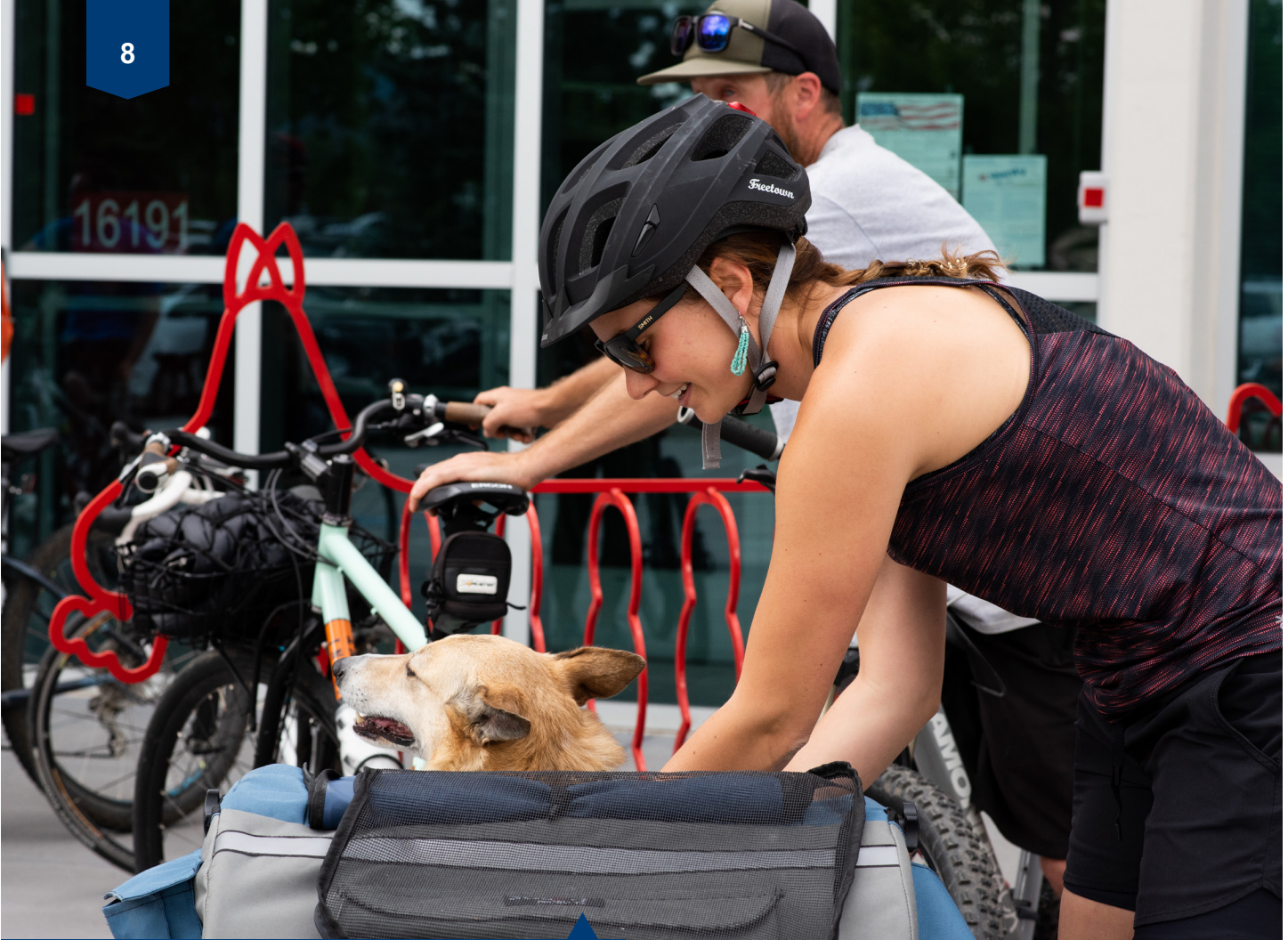
► An employee at Kong in Golden prepares to bike home with her dog on Bike to Work Day, June 26, 2019.

Aurora, Broomfield, Castle Rock, Denver, Lakewood, Littleton, Longmont, Northglenn and Westminster. Overall, 2,538 participants logged 64,366 one-way trips. They traveled 742,814 miles and saved 215.4 tons of carbon dioxide. Participants burned 3,979,980 calories and saved $205,299 in commuting costs. Category winners included Otak, The Foundation for Urban Sustainable Communities, Navigant and Gusto. Next steps: Go-Tober returns in October 2020. Contact Way to Go at waytogo@drcog.org to learn how your company can get involved.