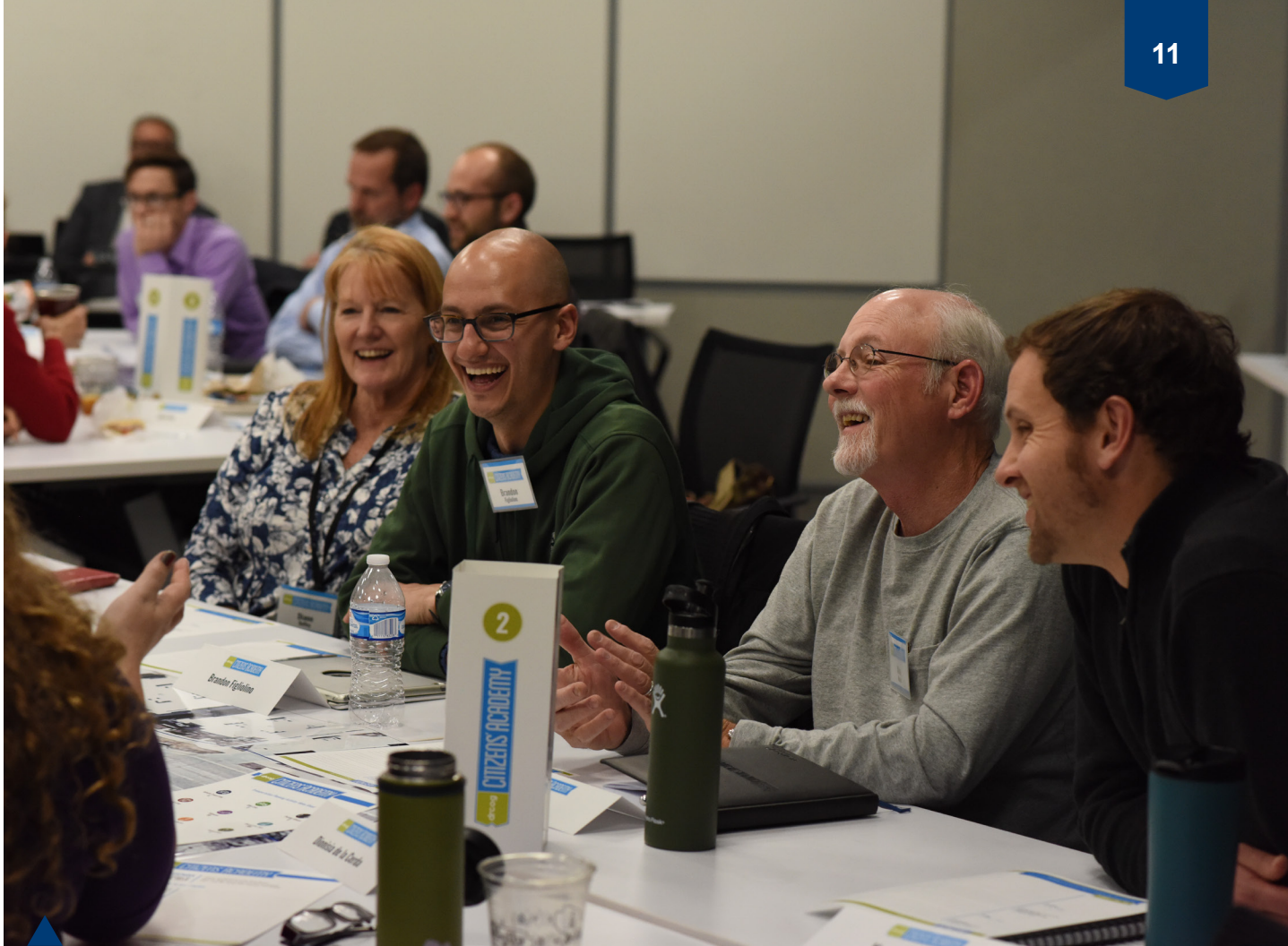
► Participants in the spring 2019 Citizens' Academy participate in a transportation planning activity.

its Boomer Bond work by facilitating age-friendly assessments by the City of Thornton and the Town of Bennett.