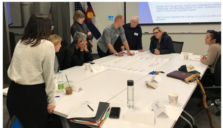
► In 2019, DRCOG formed a Civic Advisory Group to inform development of the Metro Vision Regional Transportation Plan by people representing populations traditionally under-involved in transportation planning.

In 2019, DRCOG kicked off the two-year development process for the 2050 Metro Vision Regional Transportation Plan, which guides development of the region's future multimodal transportation system in order to achieve the region's transportation goals. Over the summer, DRCOG conducted joint outreach meetings in every county in the region with the Colorado Department of Transportation, Regional Transportation District and the Southwest Chief and Front Range Passenger Rail Commission. DRCOG staff also held outreach events at several public events including the Colorado Black Arts Festival, Gilpin County Fair, Westminster Latino Festival, Boulder County Fair, Aurora Global Fest and Colorado Classic Open Streets. To supplement in-person outreach, DRCOG staff developed an online survey to learn about residents' visions and