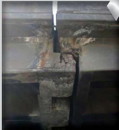
Regional and statewide analysis shows that existing revenue sources are inadequate to maintain current infrastructure. The I-70 Viaduct is pictured.

Colorado and the Denver metro area face serious funding shortages for meeting their transportation needs. Regional and statewide analyses show existing revenue sources are inadequate to maintain current infrastructure, let alone address congestion in urban and recreational areas, provide multimodal options desired by the public, address needs in agricultural and energy-impacted areas, and assure safe travel throughout the state. Colorado and the metro area need a revenue system that is reliable and sufficient. Thus, enhancements to existing revenue sources and the enactment of new revenue sources are necessary.