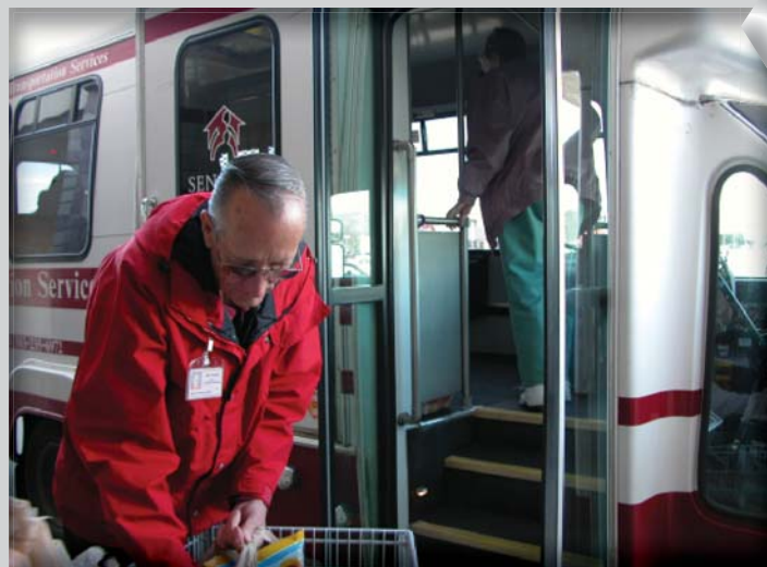
Access to transportation is of critical importance to older adults and persons with disabilities, particularly to obtain health care and food and to avoid isolation.