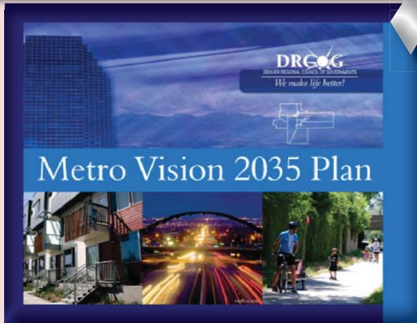
The Metro Vision plan describes a vision for the future of the region and policies to guide local growth decisions.

Regional Planning. Regional growth and development is of significant concern for metro area citizens and community leaders. As a regional planning commission under Section 30-28-105, DRCOG prepares the region's long-range plan for growth and development, transportation, and environmental quality. The regional Metro Vision plan describes a vision for the future and policies to guide local growth decisions.