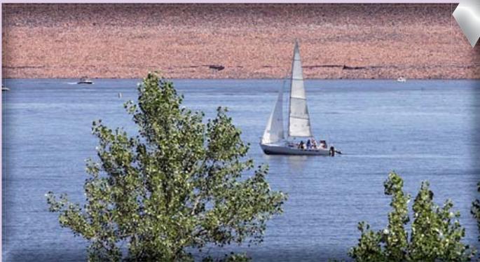
Water conservation is one of Metro Vision's sustainability goals.