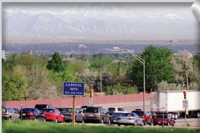
TDM programs, such as DRCOG's regionwide carpool program, can help reduce congestion and improve air quality by decreasing the amount of automobile traffic during high-demand periods.