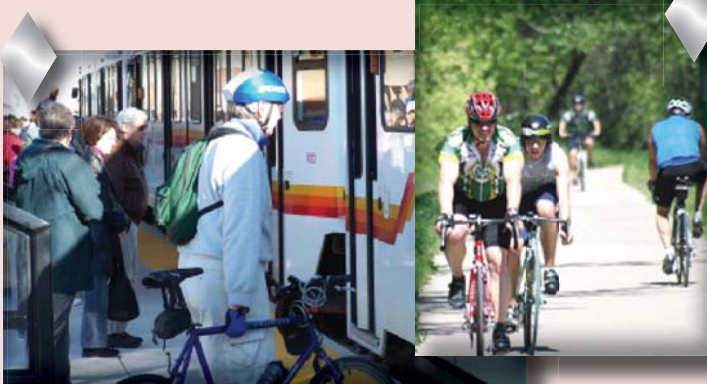
Metro Vision goals call for increasing the rate of construction of alternative transportation facilities, such as light rail and pedestrian/bicycle facilities, and reducing the percent of trips to work by single-occupant vehicle to 65 percent by 2035.