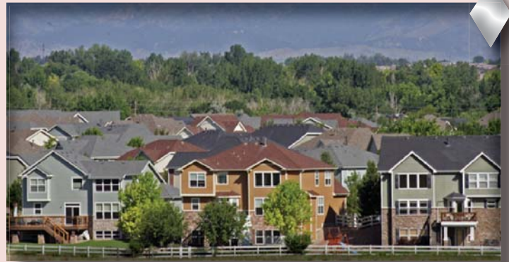
Local/comprehensive master plans provide a framework for the exercise of local land use authority. They form the basis for local growth and development decisions.

State subdivision statutes [C.R.S. 30-28-101(10)] currently exempt the division of land into parcels 35 acres or larger from local subdivision regulations. County governments have been concerned about this 35-acre exemption because it limits their ability to effectively manage development. DRCOG supports the elimination or modification of the 35-acre exemption.