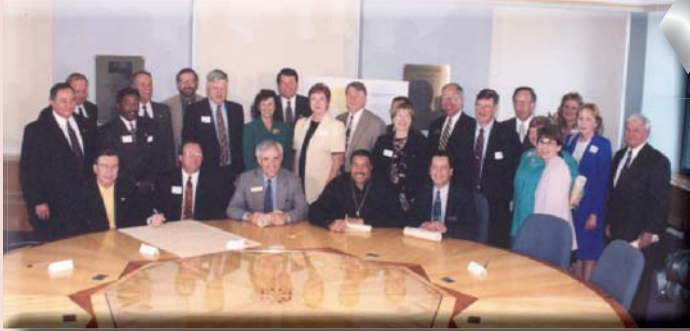
The signers of the Mile High Compact agreed that their comprehensive/master plans will follow the specific principles and contain the specific elements outlined in the compact and will ensure consistency between local plans and between local plans and Metro Vision.

The signers of the compact agreed that their comprehensive/master plans will follow the specific principles and contain the specific elements outlined in the compact and will ensure consistency between local plans and between