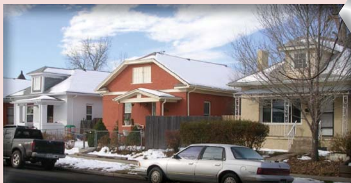
An adequate supply and mix of housing options continues to be a focus and concern of local governments.