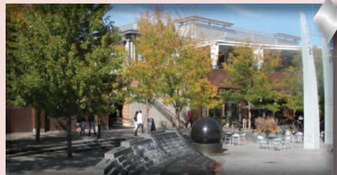
Metro Vision encourages the development of higher-density, mixed-use pedestrian and transit-oriented urban centers.