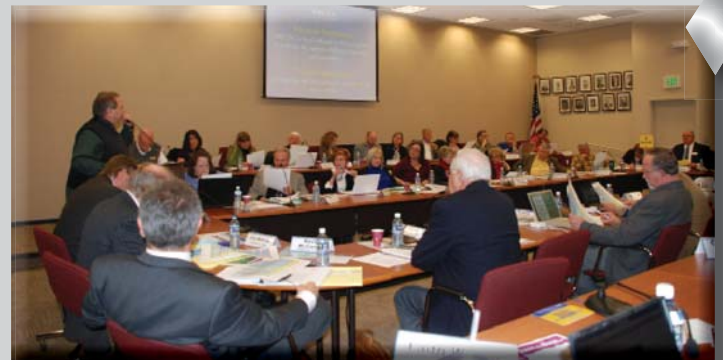
As the Metropolitan Planning Organization for the Denver region, DRCOG is responsible for planning and programming funds for a multimodal transportation system.

recognized in federal law and regulation. The MPO serves as the forum for collaborative decision-making on regional transportation issues. The MPO brings together decision-makers from local governments, other regional agencies and state transportation agencies to consider strategic and innovative solutions to regional transportation issues.