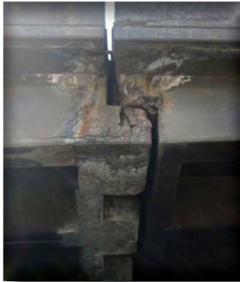
Regional and statewide analysis shows that existing revenue sources are inadequate to maintain current infrastructure. The I-70 Viaduct is pictured.

Transportation Financing. Colorado and the Denver metro area face serious funding shortages for meeting transportation needs. Regional and statewide analysis shows that existing revenue sources are inadequate to maintain current infrastructure, let alone address congestion in urban and recreational areas, provide multimodal options desired by the public, address needs in agricultural and energy-impacted areas, and assure safe travel throughout the state. Thus, enhancements to existing sources and the enactment of new, more stable and reliable sources are necessary.