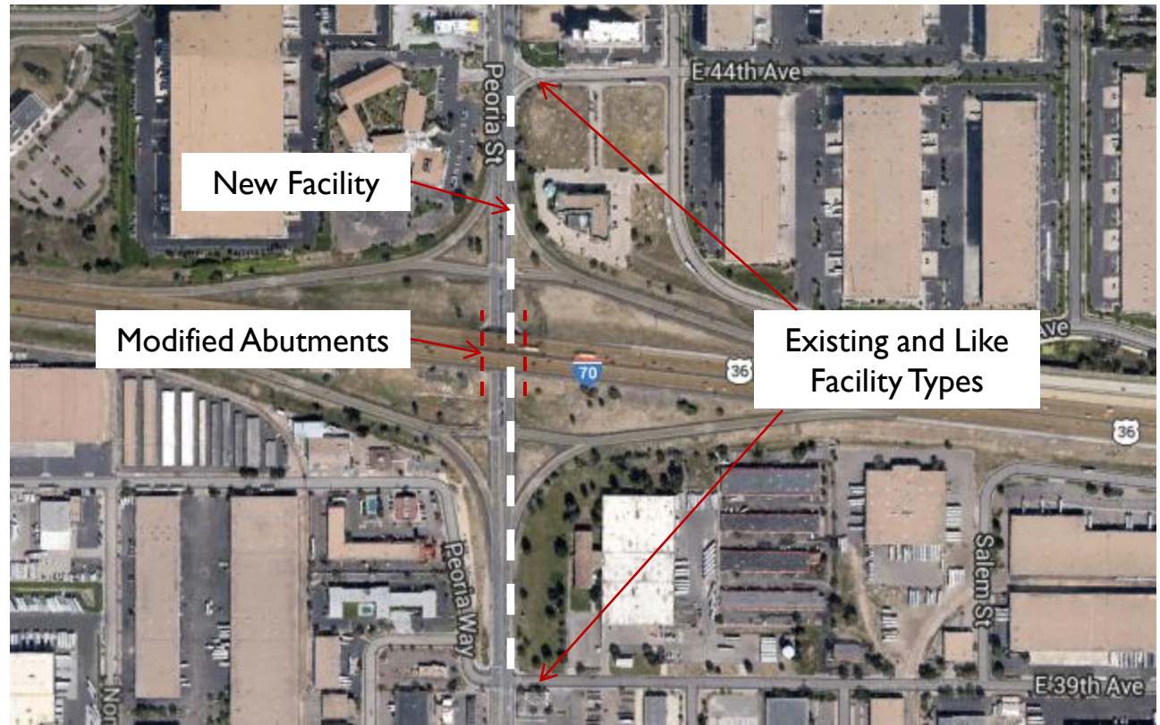
Photo looking north