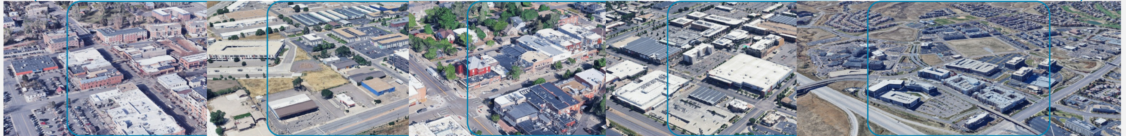
Golden's Downtown Core