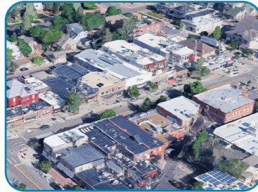
Boulder's University Hill

Linear, commercially-focused places along formerly auto-oriented corridors.