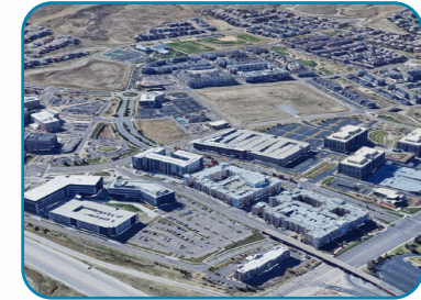
Lone Tree's Ridgeway

Development in previously auto-oriented or single-use areas that are transitioning to mixed use.