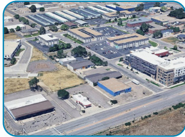
Westminster's Federal Blvd

Established mixed use places where most development is infill or adaptive re-use.