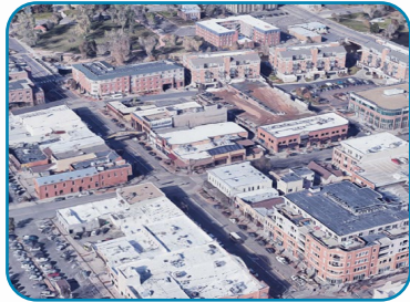
Golden's Downtown Core