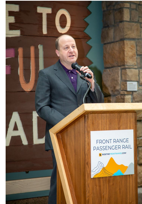
Governor Polis speaking at CIDP Acceptance Event