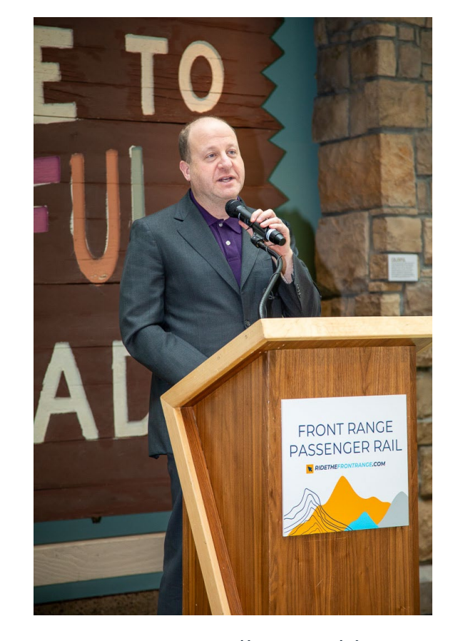
Governor Polis speaking at CIDP Acceptance Event