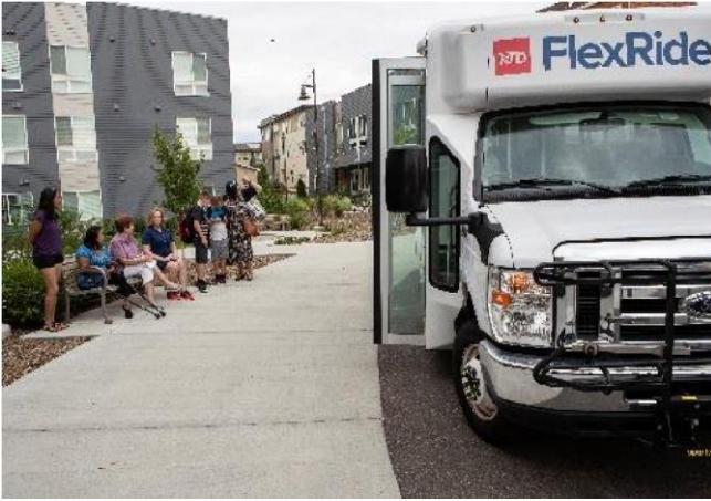
RTD Louisville FlexRide

The proposed SuperFlex vehicles will be 14-passenger, cutaway buses similar to those currently used by RTD FlexRide and Ride Free Lafayette.