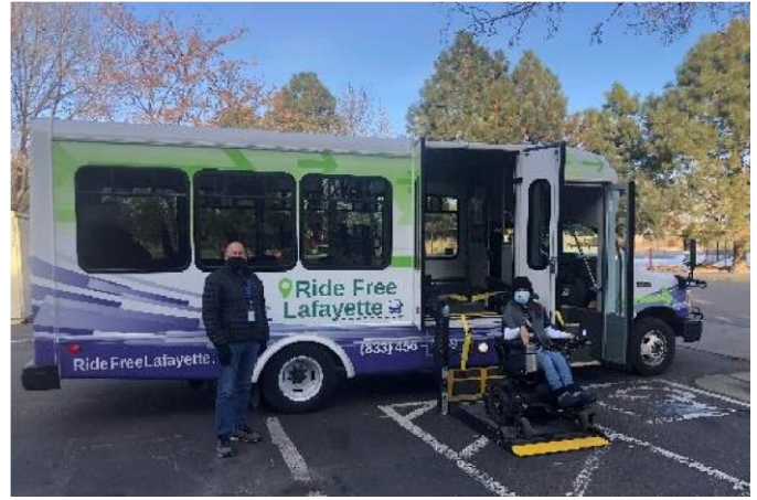
Ride Free Lafayette